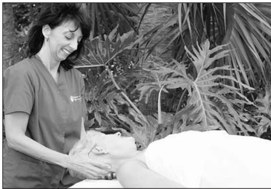
Massage Therapy is one of the many services provided through Harmony, a program of Hospice of Palm Beach County.